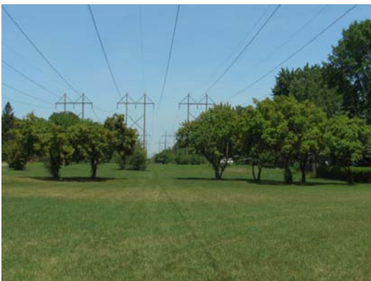
A Rapid Health Impact Assessment (HIA) tool was used to help determine if the Xcel powerline corridor is suitable for use as a trail corridor. It is!

As applied here, the aim of the assessment was to review the potential Xcel Energy Corridor Trail (as defined in Section 3) for health benefits and obstacles. Input from this assessment was used to help determine support for including the corridor as part of the alternative transportation system. A summary of findings from the workshop conducted by City of Bloomington staff with the project task force is provided on the next page.