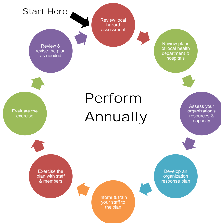
The Emergency Planning Cycle