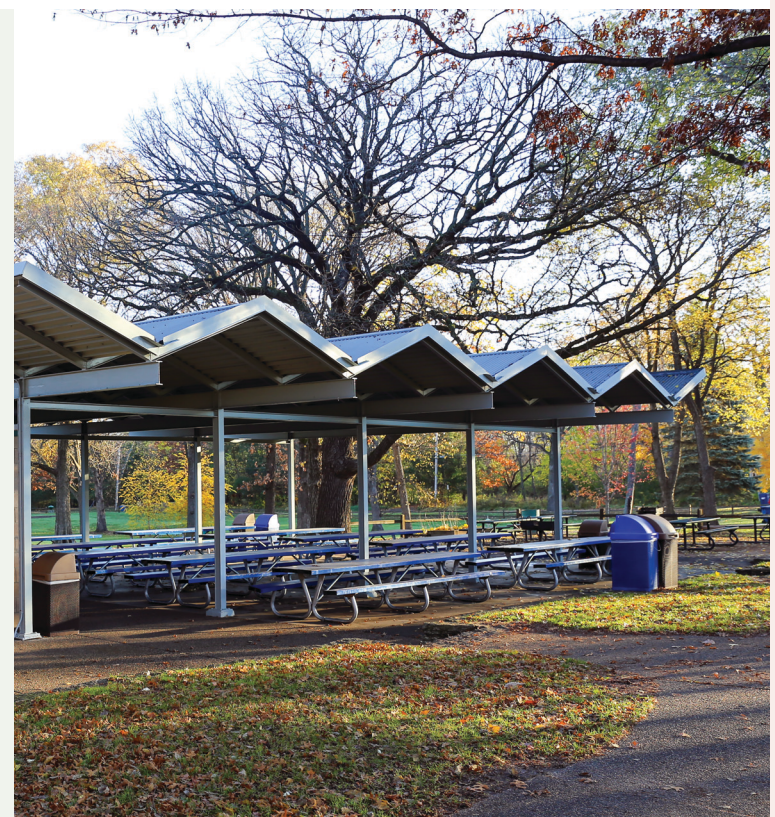
CITY OF BLOOMINGTON BRIEFING, DECEMBER 2017 • #ONEBLOOMINGTON

104th Street at Morgan Avenue, Shelter 1: Accommodates 200+, $261 plus tax; Shelter 2: Accommodates 50, $180 plus tax.