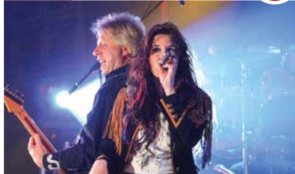
A Time Machine show is a highly energetic party with songs that are recognizable and are meant to pack the dance floor.

TUE Aug 2 Middle Spunk Creek Boys The Middle Spunk Creek Boys have brought the sounds of bluegrass to Minnesota for more than 45 years.