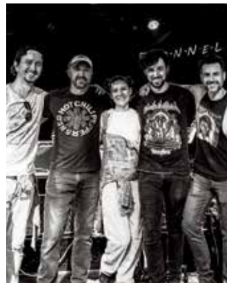
JULY 22 Feel Good, Inc.