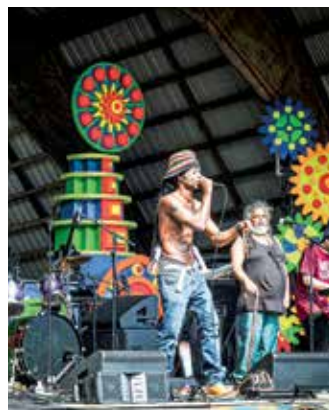
JULY 29 Dred I Dread