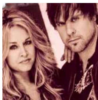
JULY 23 Hitchville