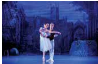
JULY 14 Continental Ballet

The sounds of summer at the Normandale Lake Bandshell, 84th and Chalet Road, featuring Bloomington's best music and dance. All shows begin at 7 p.m. and are free to the public.