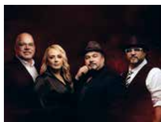
JULY 12 Tropical Zone Orchestra

Sunday Funday offers free, family-friendly live entertainment and food. This series is a great way to spend Sunday afternoons in the summer. Events take place from 6 - 8 p.m., unless otherwise noted, at locations throughout the City.