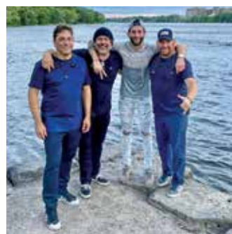
JULY 9 Rhino

Don't miss the Thursday Blockbuster events at the Normandale Lake Bandshell, featuring the best in Twin Cities music, food trucks, and beer garden. Food and beverage service begins at 6:30 p.m. and shows start at 7 p.m.