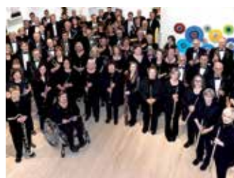
JULY 19 Medalist Concert Band

Normandale Lake Bandshell, 84th Street and Chalet Road