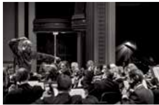
JULY 21 Bloomington Symphony Orchestra