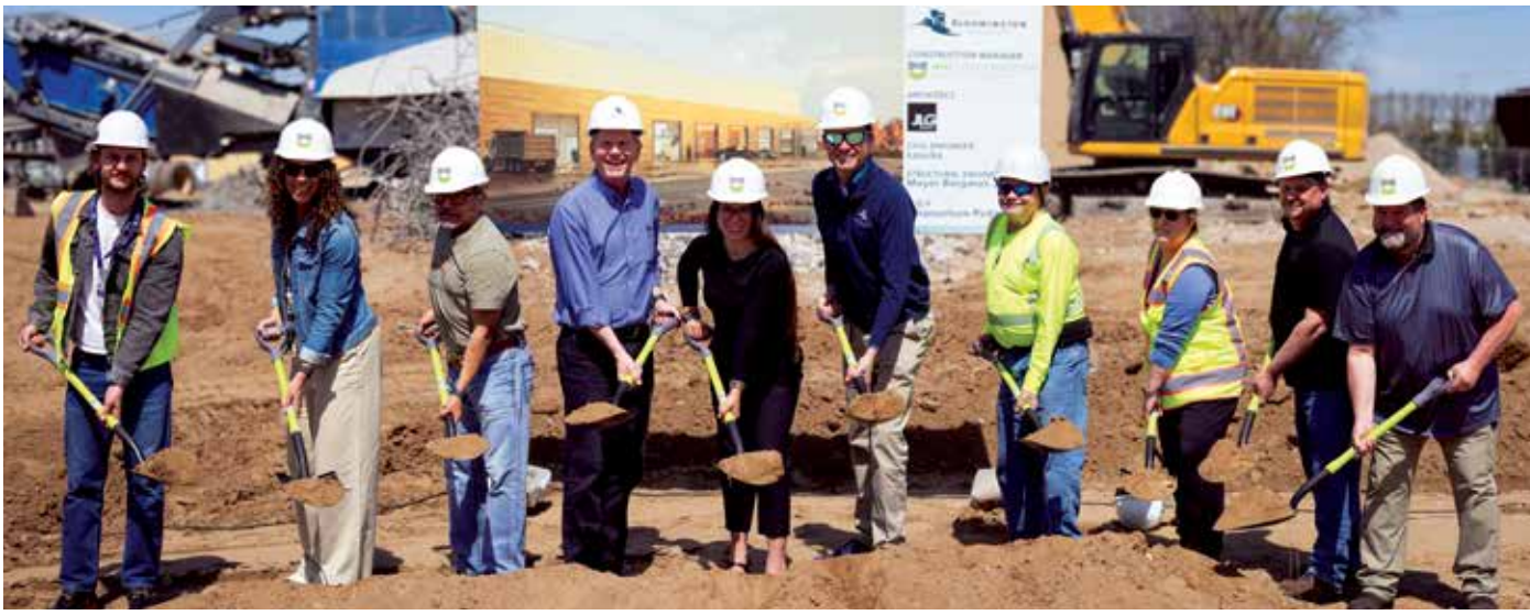
City staff and Council Members celebrate at the groundbreaking ceremony for the new fleet facility.