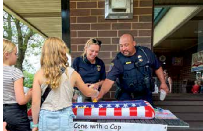
Bloomington Police staff and officers speak with community members at a Cops and Cones event in 2025.

Events like Cops and Cones reflect BPD's commitment to community connection.