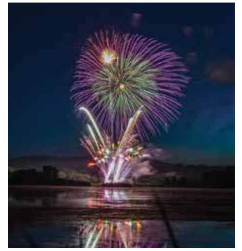
Fireworks on display over Normandale Lake during Summer Fete.

Learn how to save energy, make your home more comfortable and take steps towards home electrification and solar at these two summer sustainability events. Register for electrify everything webinars, Tuesday, June 9 and Wednesday, June 17, 6:30 p.m., on Zoom. RSVP online at blm.mn/electrify . The Home Energy Workshop will take place on Tuesday, July 30, 6:30 - 8 p.m., at Bryant Park Shelter, 1001 W. 85th St. RSVP online at blm.mn/homeenergy .