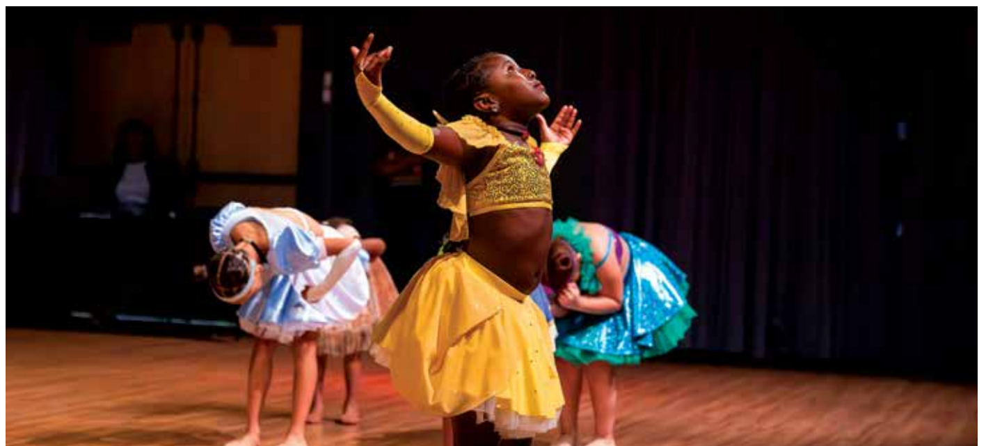
A young dancer performs as part of a group highlighted at a past Bloomington Juneteenth Celebration.

Trained staff and volunteers will be on hand to ensure a positive, peaceful and safe experience for everyone. Learn more at bloomingtonpridemn.org .