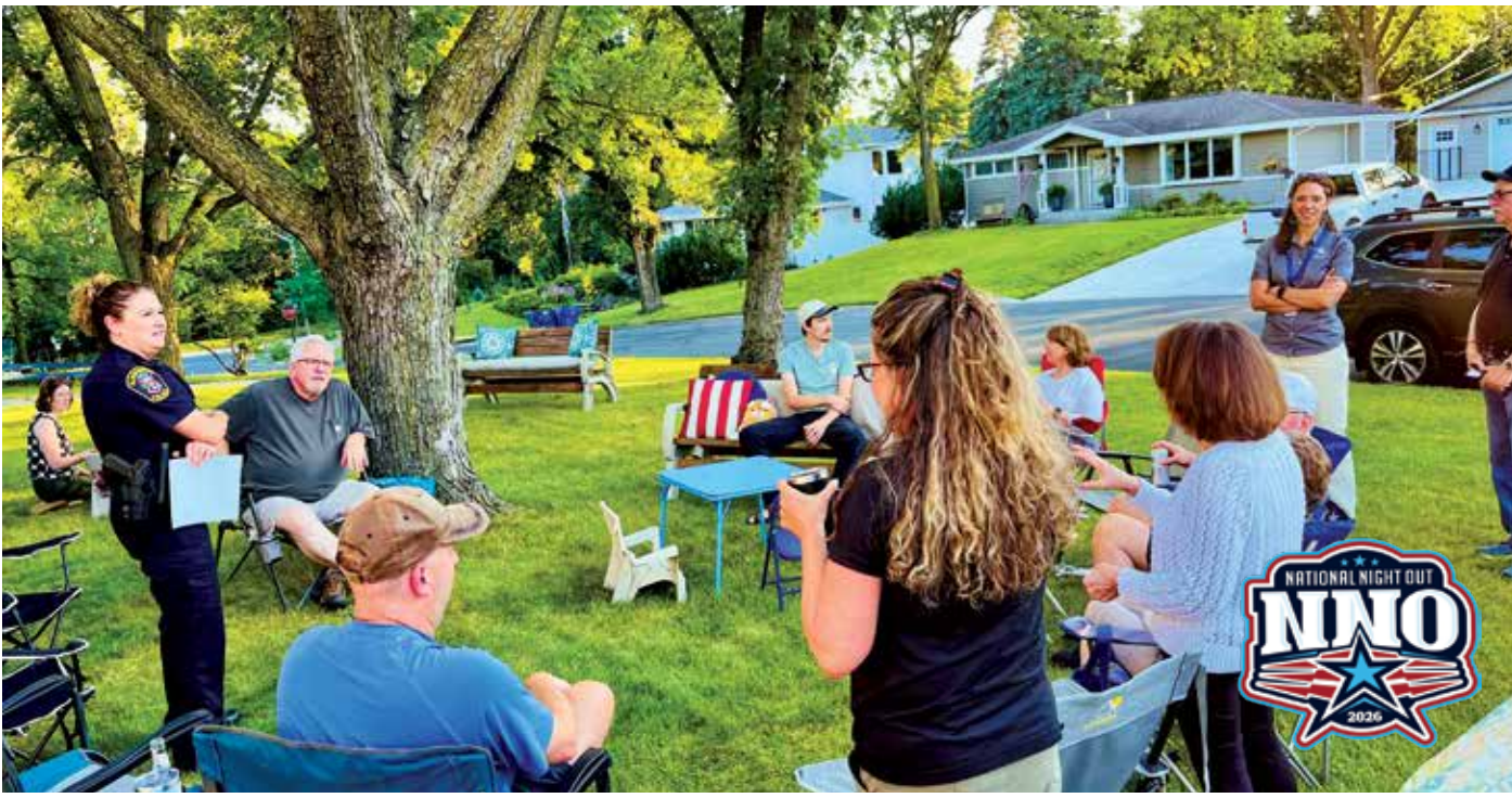
Neighbors gather for National Night Out in 2025.