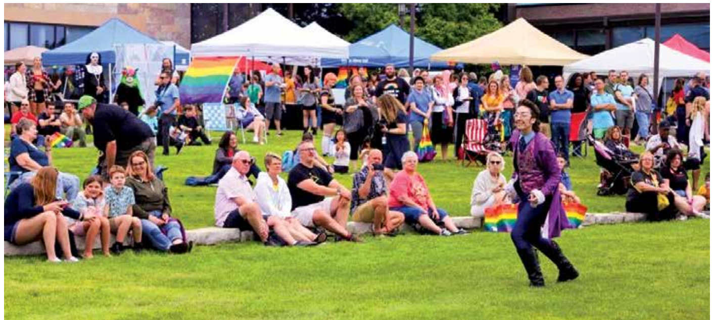
A performer entertains a crowd at Bloomington's Pride Celebration.

Harrison Park and the trailhead near it are closed for the summer. The Harrison Park community garden remains open. The Moir Park entrance to the trails will be closed when construction begins in that area later this summer, phasing in to a full park and trail closure this summer so construction can proceed safely. There will be feature stories on alternative parks and trails you can enjoy coming soon. Visit bloomingtonforward.org/9mile for the most up to date information. Learn more about the Veteran's Memorial and how to purchase a memorial dog tag at blm.mn/veterans-memorial .