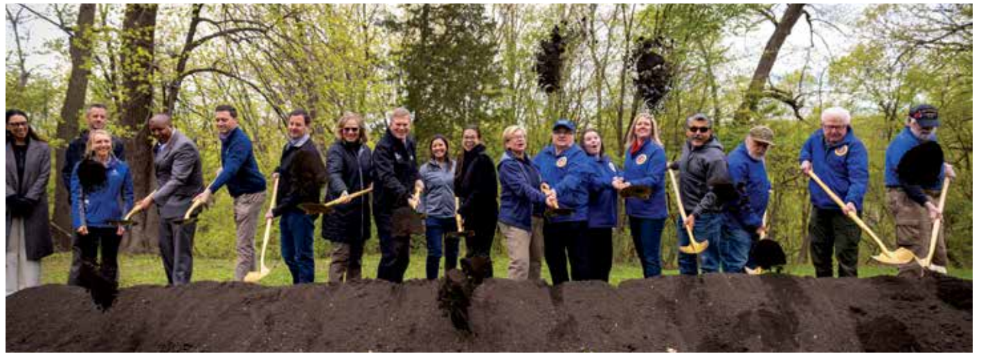
City staff, Council Members and representatives from Bloomington Remembers Veterans toss dirt at the groundbreaking ceremony for the Nine Mile Creek corridor improvements and veterans memorial.