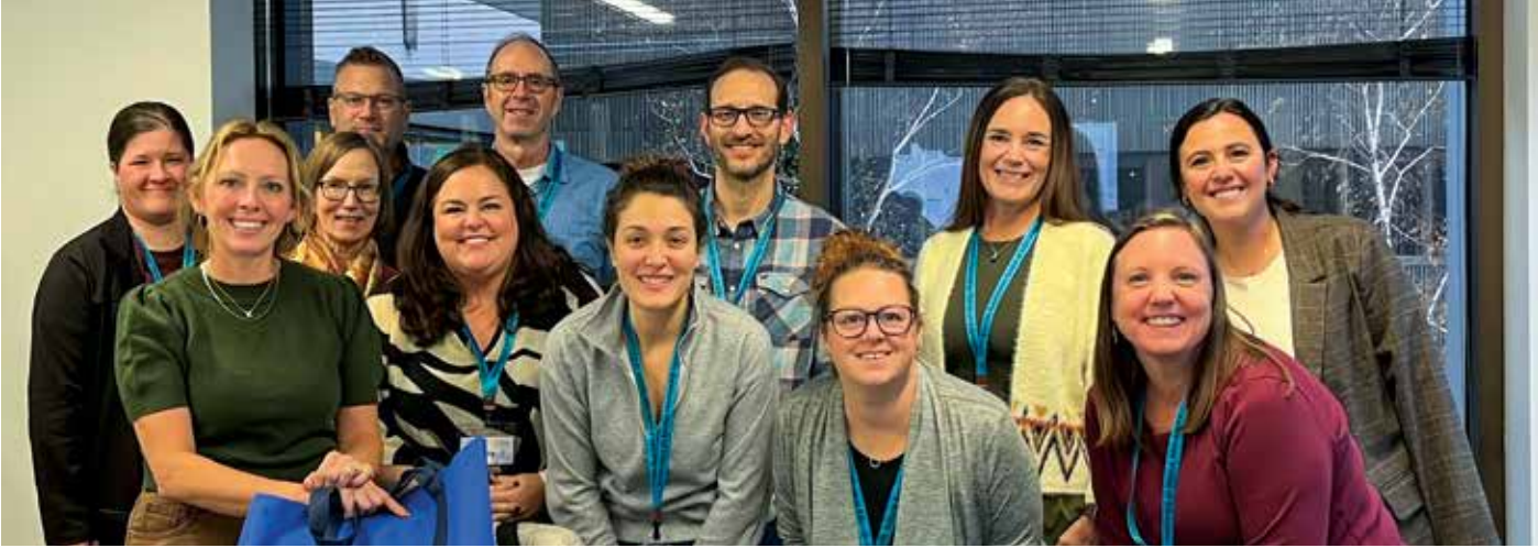
LOSS Team members from BPD and SAVE, and community volunteers pictured above.