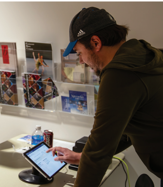
An election judge helps voters at the polling place at Civic Plaza.

Voters are allowed to register at their polling place on Election Day. To register, you must provide proof of residence. Learn more about how to register at your polling place by visiting blm.mn/voting .