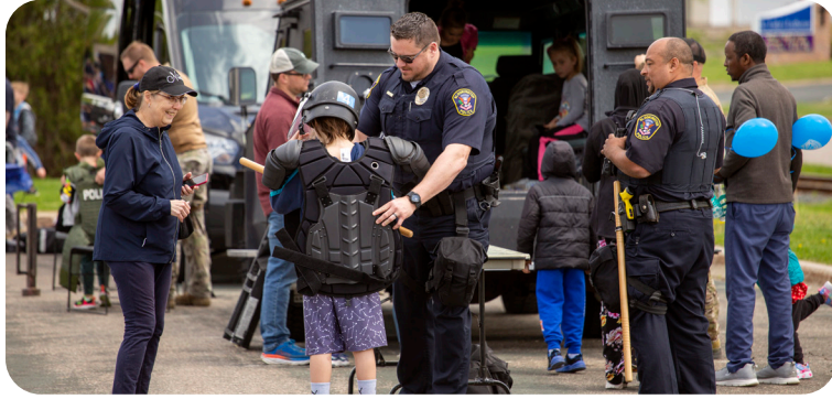
Bloomington Police Department held an open house May 2022.