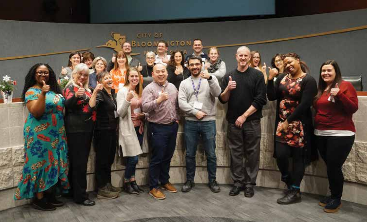
Pictured above: The 2019 class of the Bloomington Leadership Team.

The City of Bloomington does not discriminate against or deny the benefits of its services, programs, or activities to a qualified person because of a disability. The City will provide a reasonable accommodation or modify its policies and programs to allow people with disabilities to participate in all City services, programs, activities, and employment. The law does not require the City to take any action that would fundamentally alter the nature of its programs or services, or impose an undue financial or administrative burden on the City. To make a request for a reasonable accommodation, ask for more information, or to file a complaint, contact the Community Outreach and Engagement Division, City of Bloomington, 1800 West Old Shakopee Road, Bloomington, MN 55431-3027; 952-563-8733, MN Relay 711.