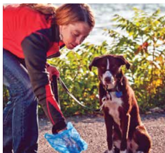
Dog poop carries harmful bacteria. Pick up after your pet.

This is an active problem in Bloomington. Nine Mile Creek is listed on Minnesota's impaired waters list for E. coli. The easiest way to solve this problem is to scoop the poop. Remember to bring baggies with you on your walks and tie baggies to your leash. Spread the word to help educate others: Too much pet waste is not a natural compost; it is a serious pollutant in lakes and streams.