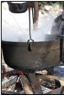
Boiling Maple Sap

Native Americans produced maple sugar for centuries and passed on their knowledge to frontier settlers. Now you can experience maple sugaring for yourself! Learn about choosing trees to tap, collecting the sap, and boiling it down to make syrup. Then watch syrup transform into maple sugar and make a paper makuk to take home. Free.