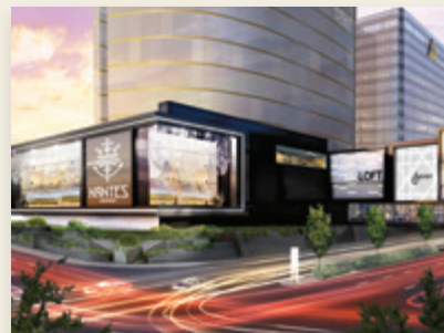
1. MOA Phase 2B (preliminary) Mix of retail, office and hotel