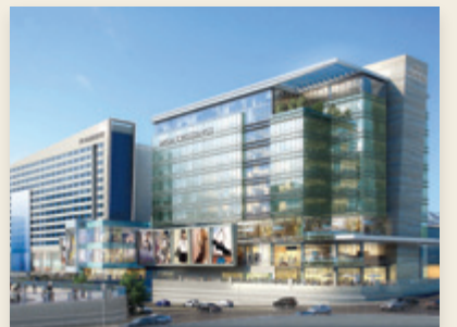
2. MOA Phase 1C (underway) JW Marriot Hotel, retail and office