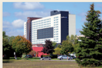
3. Radisson Blu (completed) Opened 2013