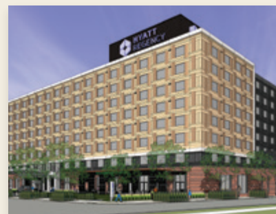
7. Bloomington Central Station Hyatt Regency Hotel (underway)