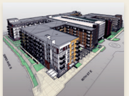
8. Bloomington Central Station IndiGO (underway)