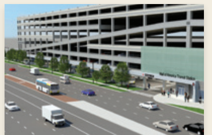
4. MOA transit station upgrade (proposed)