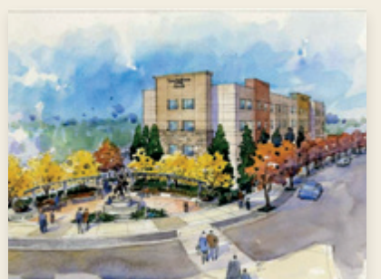
6. Marriot TownePlace Suites (underway)