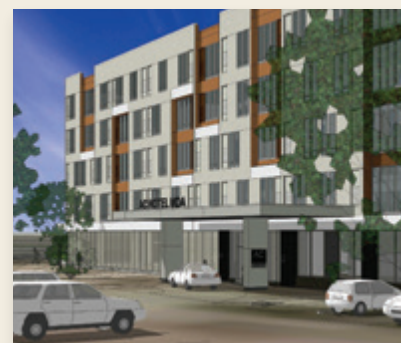
5. AC Hotel by Marriot (proposed)