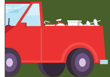
ONE LEVEL TRUCK BED OF GENERAL JUNK