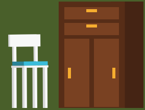
TWO PIECES OF FURNITURE