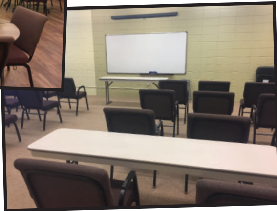
Minnesota Valley Room