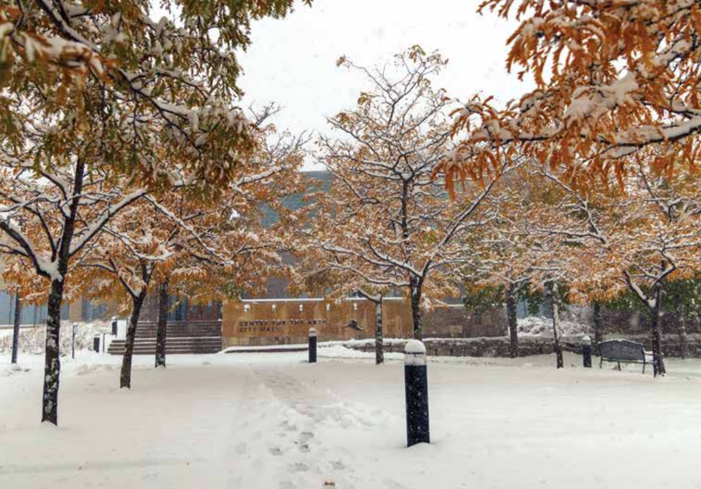
A winter scene at Bloomington Civic Plaza, 1800 West Old Shakopee Road.

The City of Bloomington does not discriminate against or deny the benefits of its services, programs, or activities to a qualified person because of a disability. The City will provide a reasonable accommodation or modify its policies and programs to allow people with disabilities to participate in all City services, programs, activities, and employment. The law does not require the City to take any action that would fundamentally alter the nature of its programs or services, or impose an undue financial or administrative burden on the City. To make a request for a reasonable accommodation, ask for more information, or to file a complaint, contact the Community Outreach and Engagement Division, City of Bloomington, 1800 West Old Shakopee Road, Bloomington, MN 55431-3027; 952-563-8733, MN Relay 711.