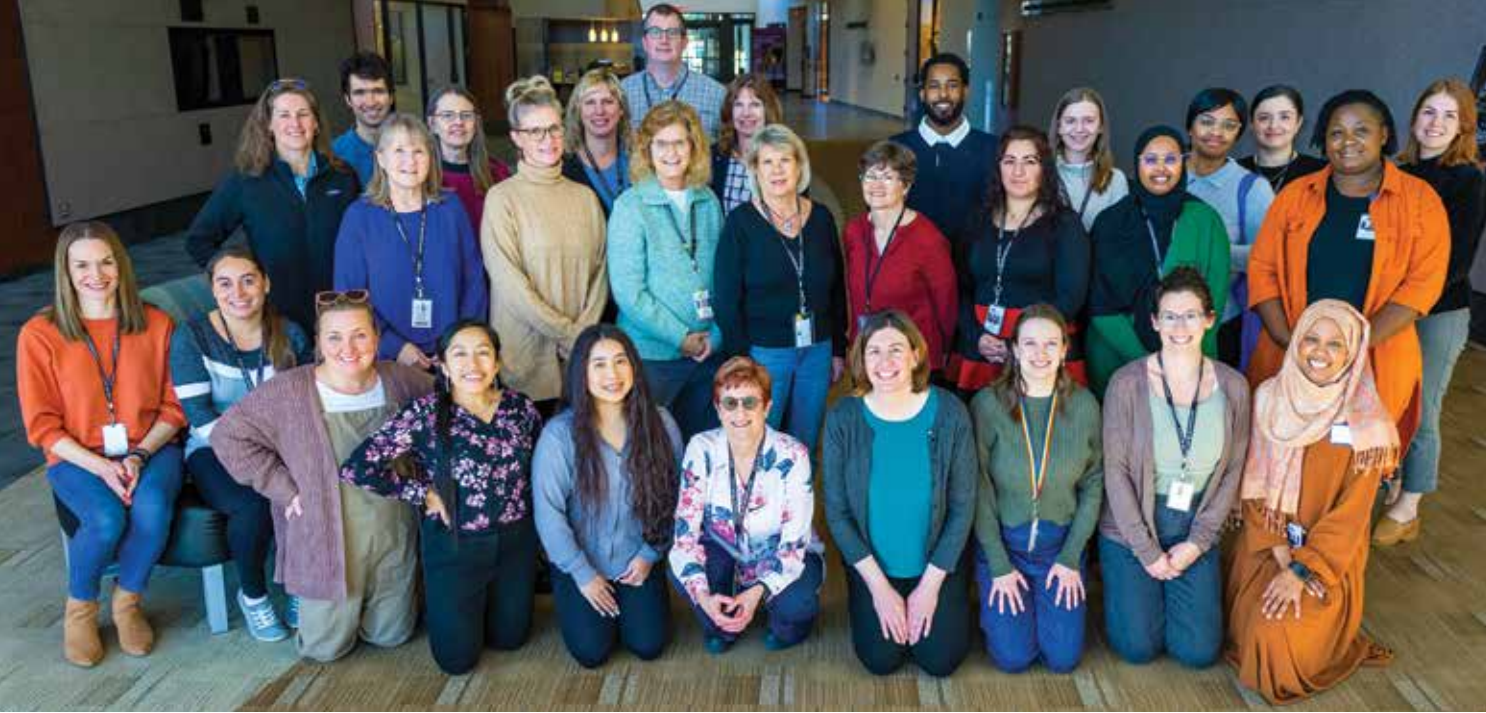
Bloomington Public Health staff protect, connect and serve our community.