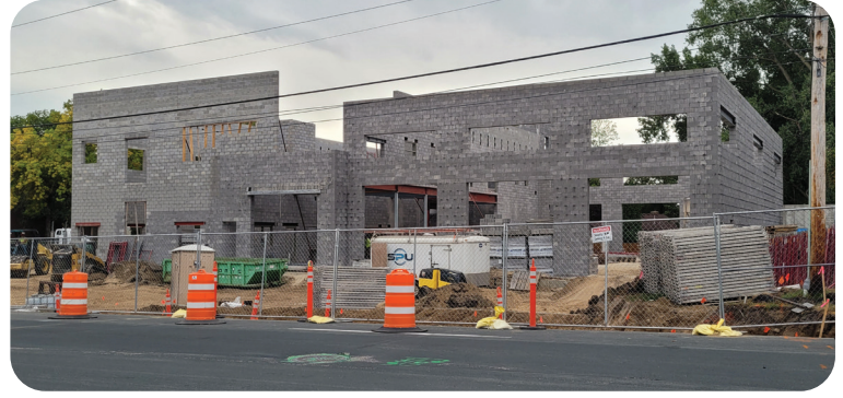
Dhismaha Xarunta Dab damiska #4, 4201 West 84th Street, Sibteembar 2022.

D awlada Hoose ee Bloomington waxay qaban doontaa dhagaysi dadwayne si ay u dhagaysato fikradaha la xidhiidha canshuurta lasoo jeediyay ee 2023 iyo miisaaniyada Isniinta, Diseembar 5, 6:30 pm. oo lagu qaban doono Xarunta Dawlada Hoose ee Civic Plaza, 1800 West Old Shakopee Road. Si aad u hesho macluumaadka ku saabsan sida uu qofku qaab toos ah ama qaab oonleen ah uga qaybgalo, booqo blm.mn/cc-1205 ama wac 952-563-8790.