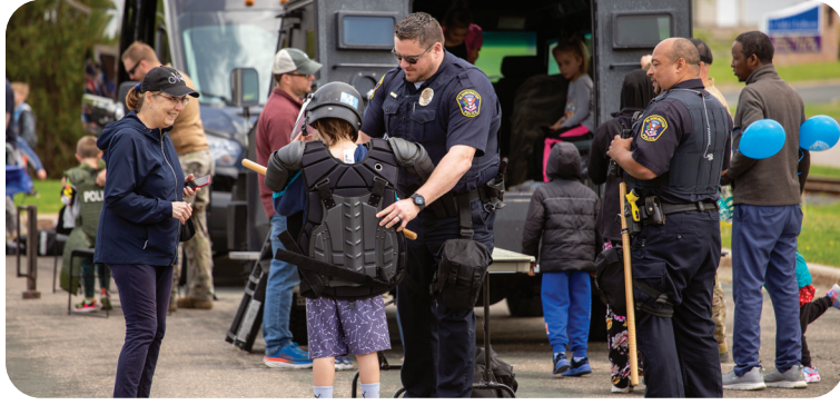
Waaxda Booliiska ee Bloomington ayaa kulan furan qabatay Maayo 2022.